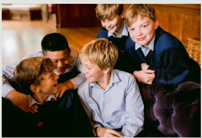
1 Kindness and tolerance, so children leave as capable and compassionate young people, inspired to play their part in making the world a better place.