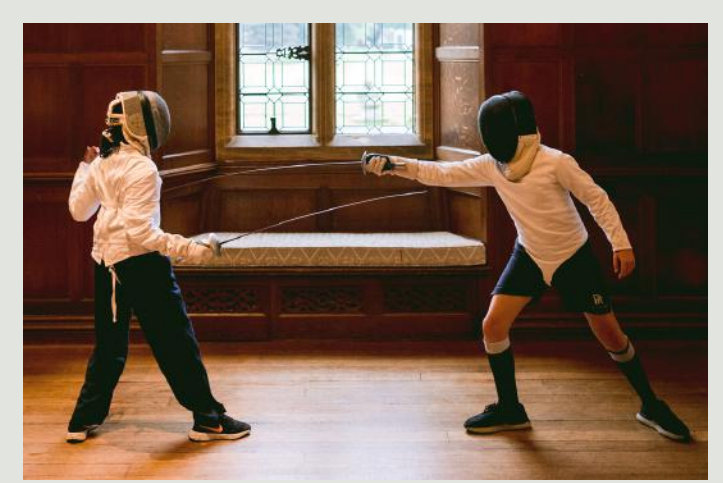
A passion for developing the unique academic, sporting and creative talents of every child – giving equal measure to the head, hand and heart.