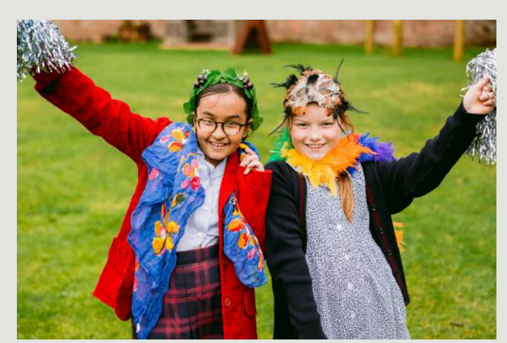
A global perspective that celebrates the diversity of our children and the friendships between those of different cultures and backgrounds.