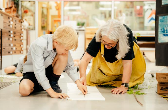
Extraordinary teaching that stretches and supports every child, enabling them to discover the discipline of study and the delight of learning.