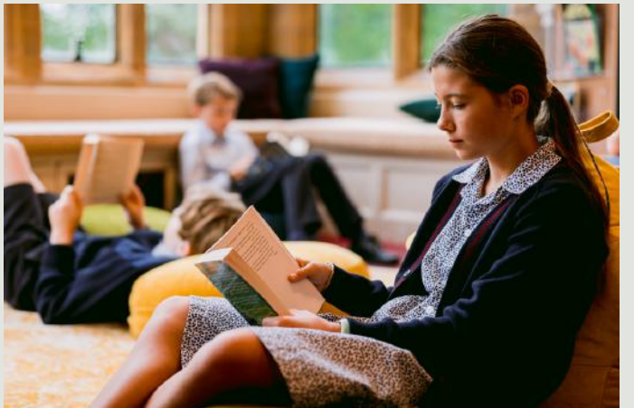
Strong moral, social and spiritual values, for those of all faiths or none.