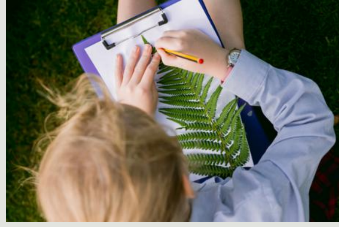
A culture that embeds in every child a sense of wonder for the natural world and a responsibility to preserve it.